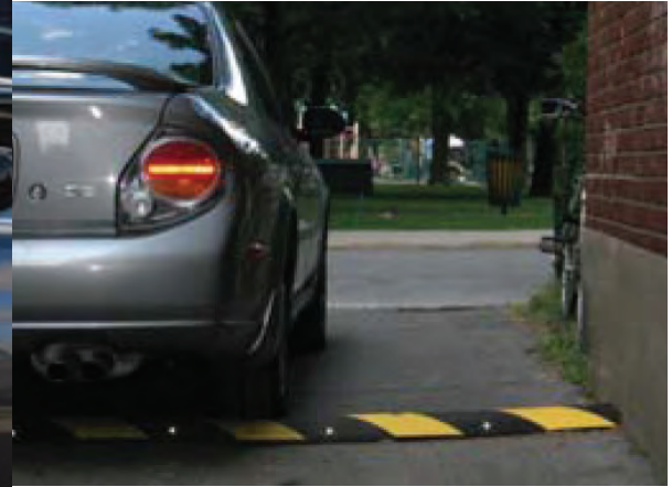
PICTURED: SPEED BUMP

Checkers™ is a full-service manufacturer of parking lot safety solutions. We design and manufacture traffic control products that help cars navigate and park safely. Our main goal has been to create solutions that protect motorists and pedestrians from the perils of today's parking lots. As such, Checkers™ products have been designed and developed with speed reduction, driver and pedestrian safety in mind. All our solutions are manufactured from 100% recycled rubber and plastic. Our speed bumps or parking blocks, for example, are longer lasting, highly visible, and more car-friendly than asphalt or concrete alternatives. Not only are Checkers™ traffic safety solutions environmentally friendly, they can also be installed for either temporary or permanent use.